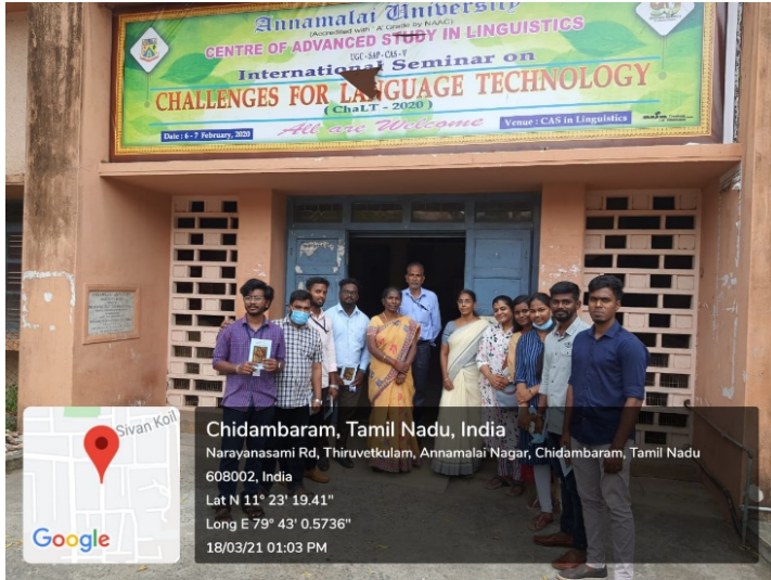
Chidambaram, Tamil Nadu, India Narayanasami Rd, Thiruvetkulam, Annamalai Nagar, Chidambaram, Tamil Nadu 608002, India Lat N 11° 23' 19.41" Long E 79° 43' 0.5736" 18/03/21 01:03 PM