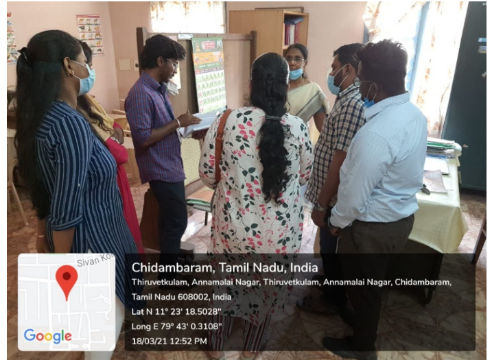
Chidambaram, Tamil Nadu, India Thiruvetkulam, Annamalai Nagar, Thiruvetkulam, Annamalai Nagar, Chidambaram, Tamil Nadu 608002, India Lat N 11° 23' 18.5028" Long E 79° 43' 0.3108" 18/03/21 12:52 PM