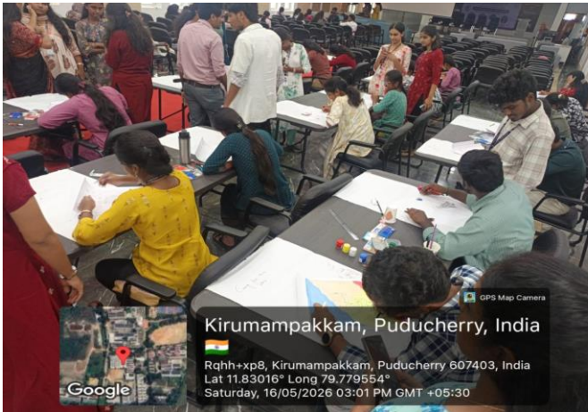
Participants engaged in Poster Making