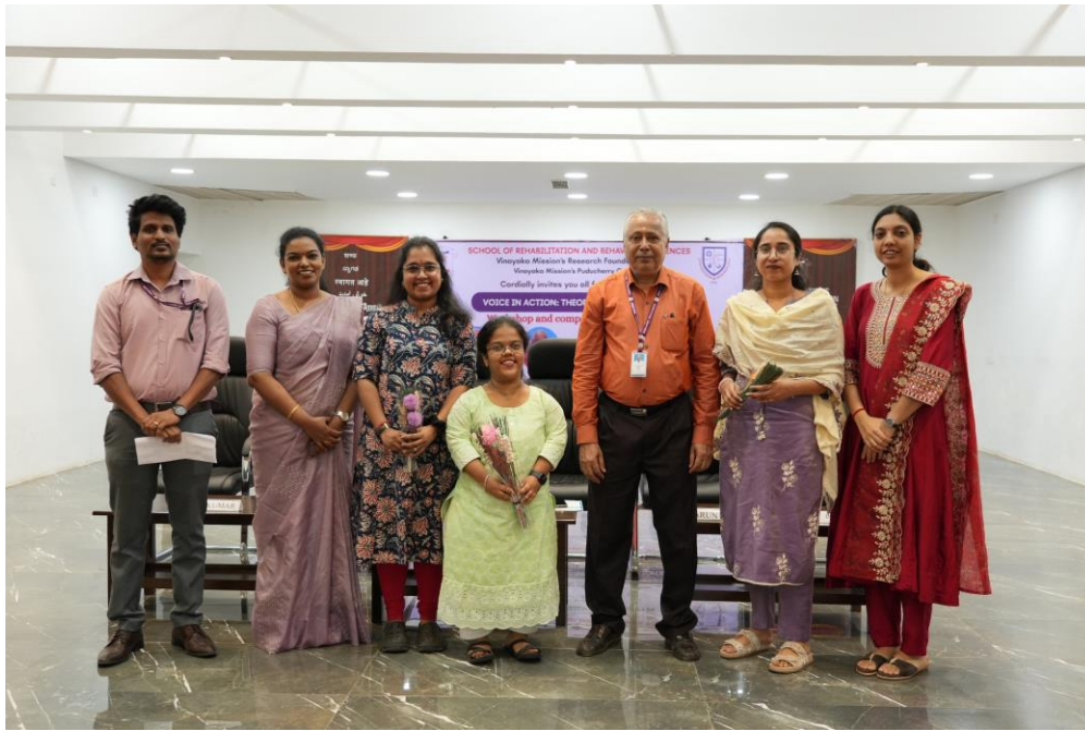
Group photograph of dignitaries and organizing team