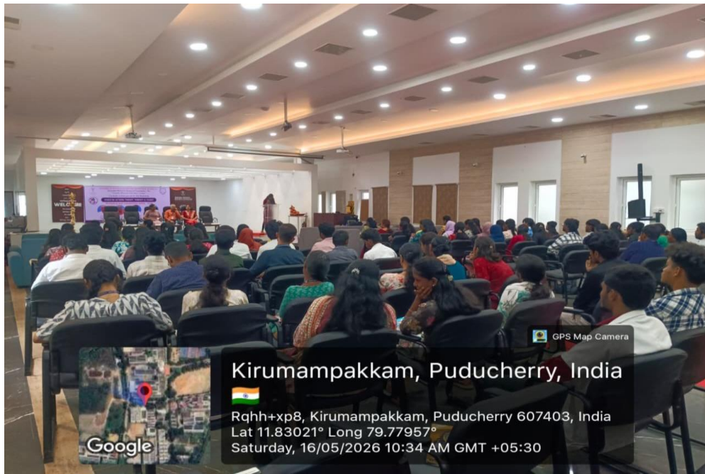
Participants attending the technical workshop session