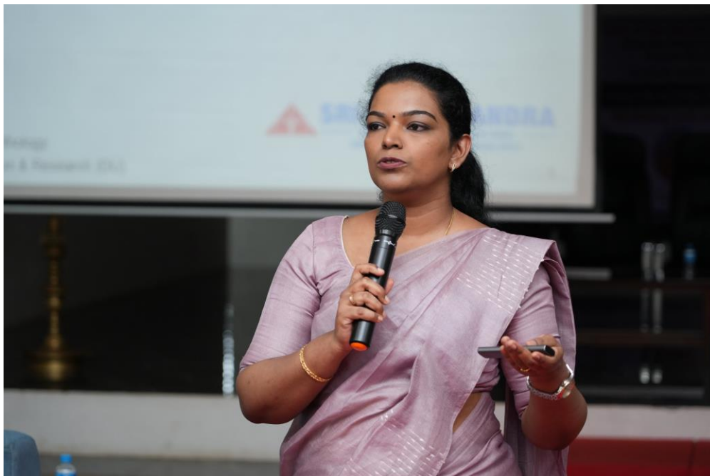
Technical session on VOICE IN ACTION