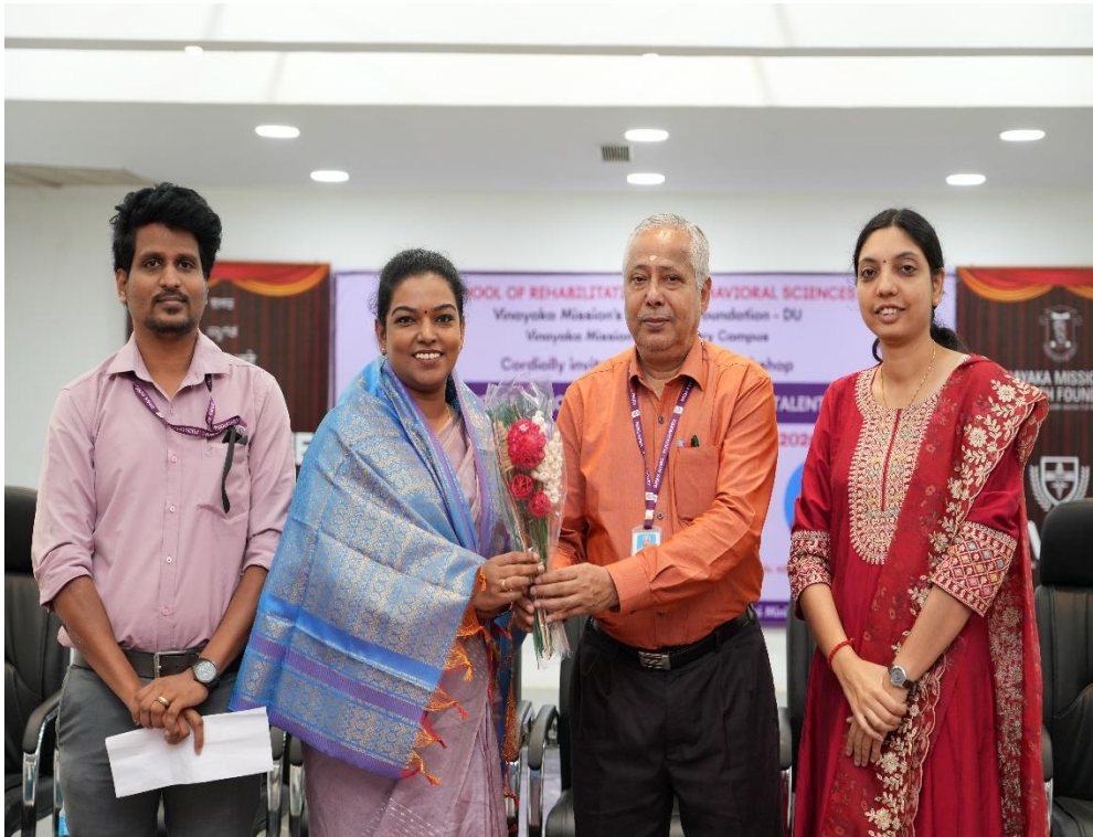
Felicitation during the Inaugural Ceremony