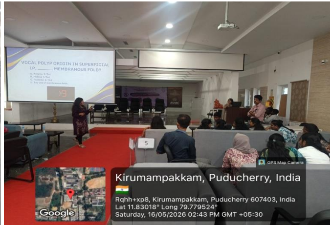
participant engaged in quiz activity