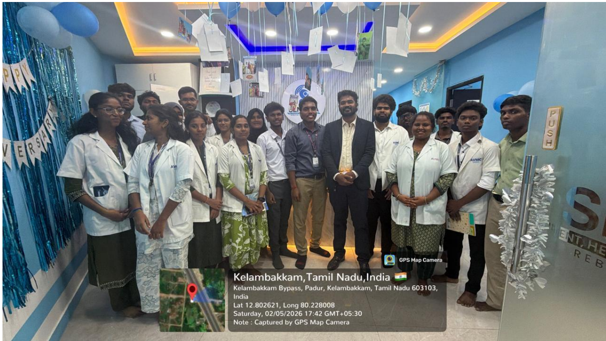
Kelambakkam, Tamil Nadu, India 🇮🇳 Kelambakkam Bypass, Padur, Kelambakkam, Tamil Nadu 603103, India Lat 12.802621, Long 80.228008 Saturday, 02/05/2026 17:42 GMT+05:30 Note : Captured by GPS Map Camera