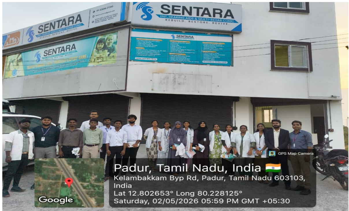
Padur, Tamil Nadu, India 🇮🇳 Kelambakkam Byp Rd, Padur, Tamil Nadu 603103, India Lat 12.802653° Long 80.228125° Saturday, 02/05/2026 05:59 PM GMT +05:30